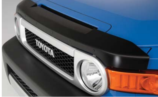
Hood protector Chrome exhaust tip