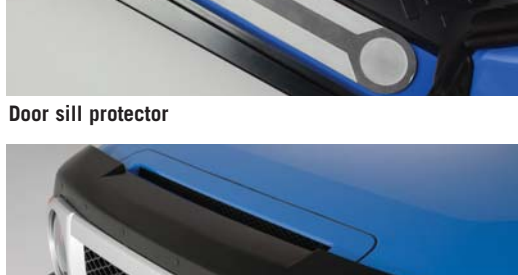
of your new FJ Cruiser by choosing from the following list of Accessories: